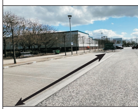
Shoosmiths Client Spaces (View from Shoosmiths' Building)